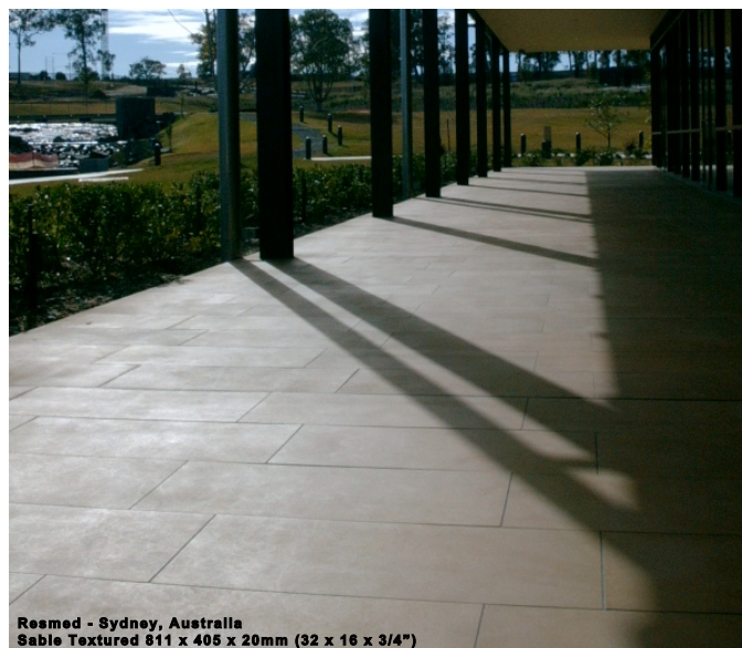
Resmed - Sydney, Australia Sable Textured 811 x 405 x 20mm (32 x 16 x 3/4")

Contact Sadlerstone at worldsales@sadlerstone.com for all your project needs!