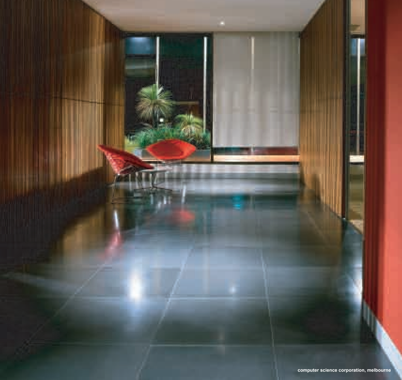
computer science corporation, melbourne

Sadlerstone can even customise a colour for special projects. Adding to this, all of our colours can be paired with a granite, marble, quartz, or bluestone aggregate creating a seemingly endless choice of options for your project.